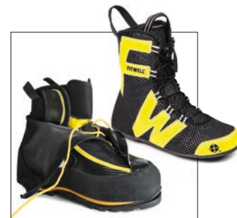
SCAFO INTERNO, SCARPETTA ESTRAIBILE INTERNAL SHEEL, INNER BOOT

tessuto microforato / microperforated fabric film in alluminio / aluminium layer intercapedine in EVA / EVA interspace Primaloft® / Primaloft® membrane tessuto assorbente microforato / microperforated absorbing fabric